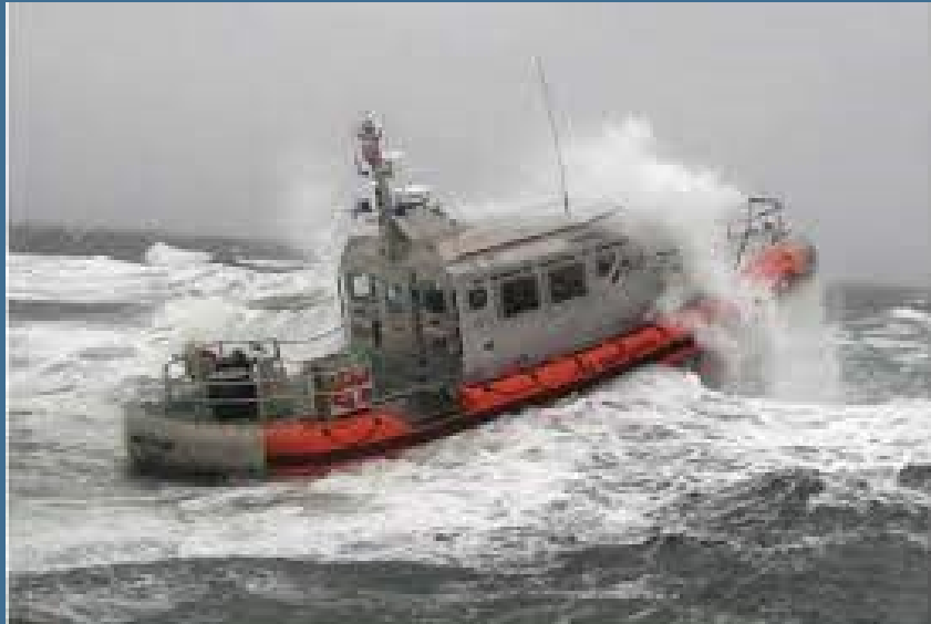
COAST GUARD SAFE BOAT 42'NLB